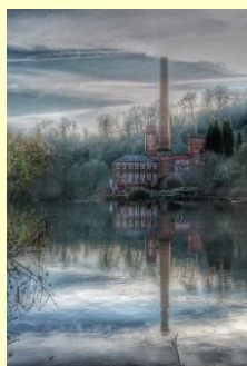
1 st Prize 2016, Carl Harvey

There is also time to enter our Photography Competition. This year marks the 8 th Pro Loco Photography Competition hosted by the Parish Council and we look forward to showcasing your photographs of our beautiful village. Entrants have until Monday 2 nd October to submit up to 4 photographs depicting a scene or artefact of Matlock Bath. To enter the competition you will need to upload your photographs via our website. The competition is open to all age groups, with 4 separate prize categories.